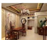
Building materials Industry